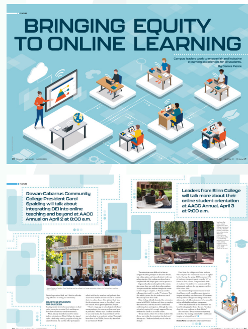
Community College Journal (CCJ) Feature layout