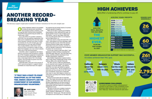
ACEC 2021 – 2022 Annual Report