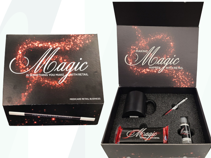
Aetna 2022 Agent Appreciation Kit